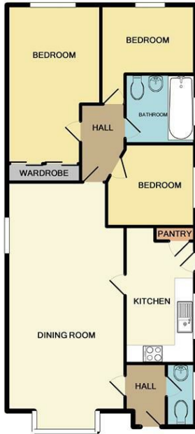
4 DAWN VIEW TROWELL PARK NOTTINGHAM NG9 3QU Whilst every attempt has been made to ensure the accuracy of the floor plan contained here, measurements of doors, windows, rooms and any other items are approximate and no responsibility is taken for any error, omission, or mis-statement. This plan is for illustrative purposes only and should be used as such by any prospective purchaser. The services, systems and appliances shown have not been tested and no guarantee as to their operability or efficiency can be given. Made with Metropix ©2015